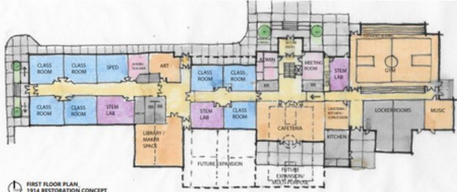
FIRST FLOOR PLAN 1914 RESTORATION CONCEPT

Reclaiming the 1914 original school entry provides a new secure entry with adjacent administration offices and fully accessible spaces via elevator on the main level & upper level. A small addition provides for upgraded egress for the second floor along with an additional teaching space. The fully accessible entry allows for increased visibility and expanded pick-up/drop-off zones related to safety and security for pedestrian and vehicular traffic flow. This concept separates school-hour use from after-hour use by relocating the main entry to separate these functions. Smaller additions and renovations will allow for both more gym and cafeteria seating, while providing a new commercial kitchen. The library will be upgraded with maker spaces. Classroom reorganization will be enhanced by twenty-first century STEM labs. This concept also includes updating the baseline facility deficiencies and is master planned for future additions and growth.